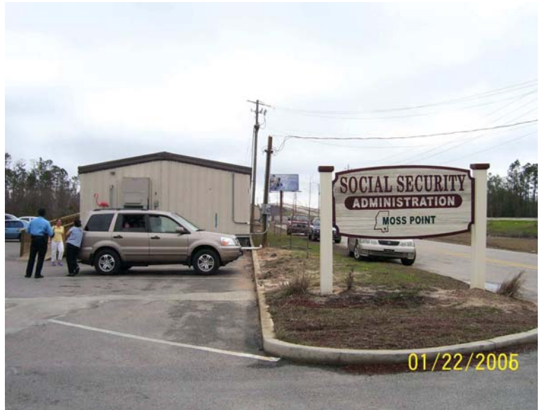
Moss Point temporary office: a double-wide