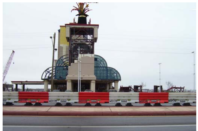
Casino in Biloxi — Story starts on page 1...