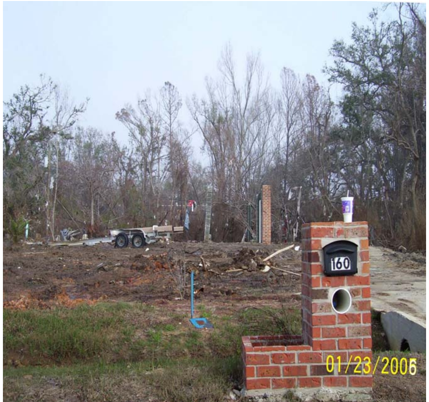
Moss Point site — Related story starts on page 1...

For information on AFGE Council 220's Officers and Locals, visit afgec220atl.org